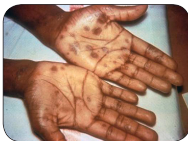
Secondary rash from syphilis on palms of hands.

During the first (primary) stage of syphilis, you may notice a single sore, but there may be multiple sores. The sore is the location where syphilis entered your body. The sore is usually firm, round, and painless. Because the sore is painless, it can easily go unnoticed. The sore lasts 3 to 6 weeks and heals regardless of whether or not you receive treatment. Even though the sore goes away, you must still receive treatment so your infection does not move to the secondary stage.