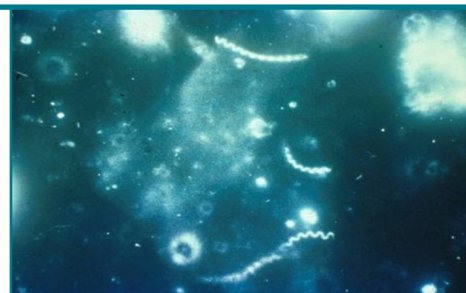
Darkfield micrograph of Treponema pallidum

Most of the time, a blood test can be used to test for syphilis. Some health care providers will diagnose syphilis by testing fluid from a syphilis sore.