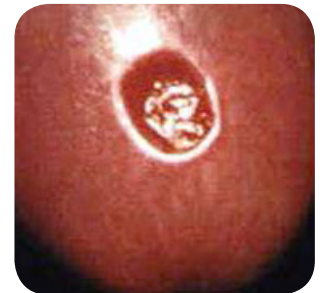
Example of a primary syphilis sore.

Washing your genitals, urinating, or douching after sex will not protect you from getting syphilis.